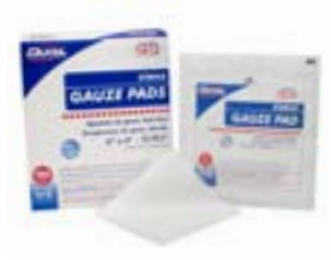
Gauze & Non-Woven Dressings

> To learn more, click a category or visit our website