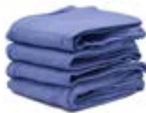
Lap Sponges & OR Towels